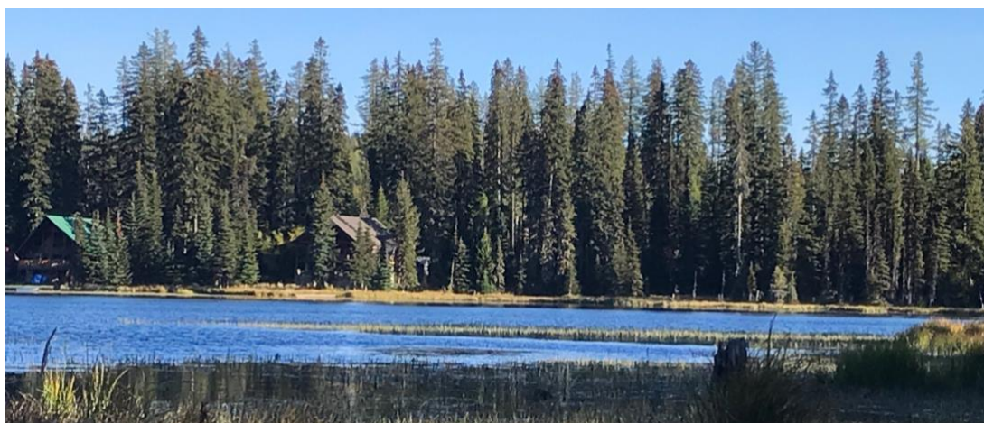
Langdon Lake, Tollgate, Blue Mountains, eastern Oregon. Photo: Theo Dreher, Oct 2022