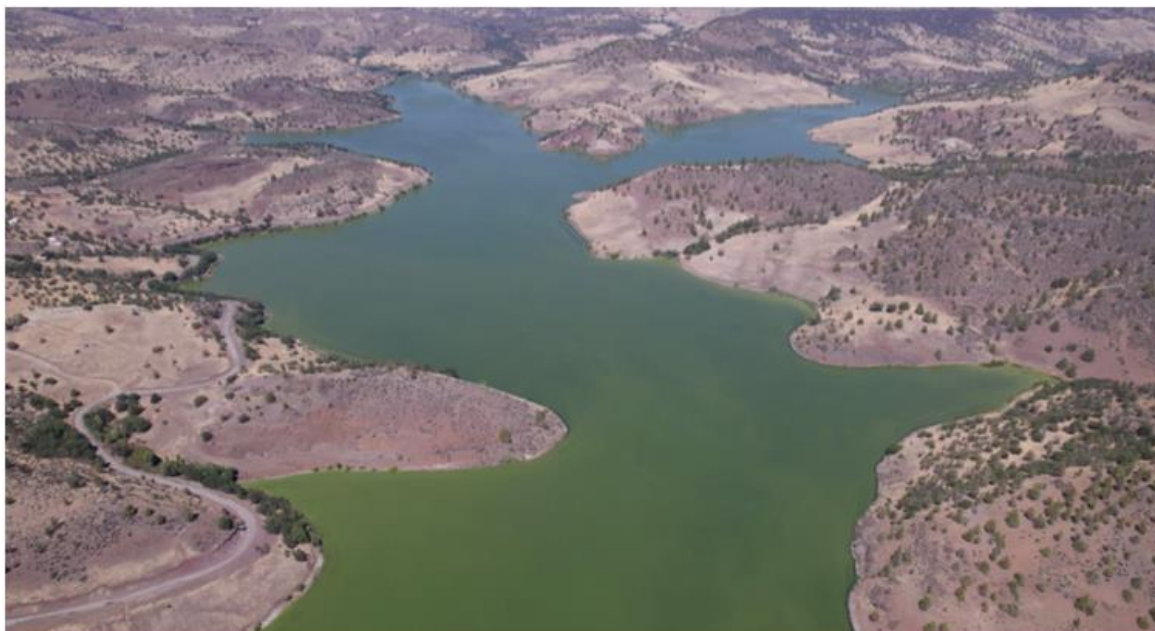
Iron Gate Reservoir during the summer algal bloom

Researchers have been coordinating to install sensors and make measurements of the river to document ecosystem changes during dam removal and to identify the next steps for recovering the ecosystem beyond dam removal. The project is catalyzing new science and new collaborations, with the expectation that dam removal is a big step, but not the only step, towards a sustainable Klamath River and Klamath communities.