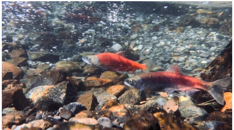
Kokanee in Wallowa River beside the lodge, just upstream of the lake.

Anadromous sockeye runs 24-30,000-strong are estimated to have existed prior to 1900, but by 1904 the runs were extinct in the lake, due to a combination of over-harvesting, installation of stream blockages, and mistaken understanding of sockeye biology ( Cramer & Witty, 1998 ). Kokanee salmon, the sockeye's lake-bound relative, have remained in the lake, although stocking with kokanee from surrounding states occurred during the 1960's in order to buttress the failing local population. Kokanee have remained abundant since the 1980's, and we were able to witness spawning kokanee in a braid of the Wallowa River just outside the lodge (see photo). Among the uncertainties that make the reintroduction a challenge is debate about the exact relationship between sockeye and kokanee, and whether kokanee could be expected to regain an anadromous sockeye-type lifestyle, as some people believe.