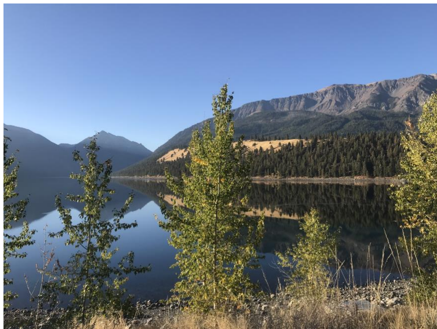
Chief Joseph Mountain overlooking Wallowa Lake

OLA committees and subcommittees: Opportunities to help